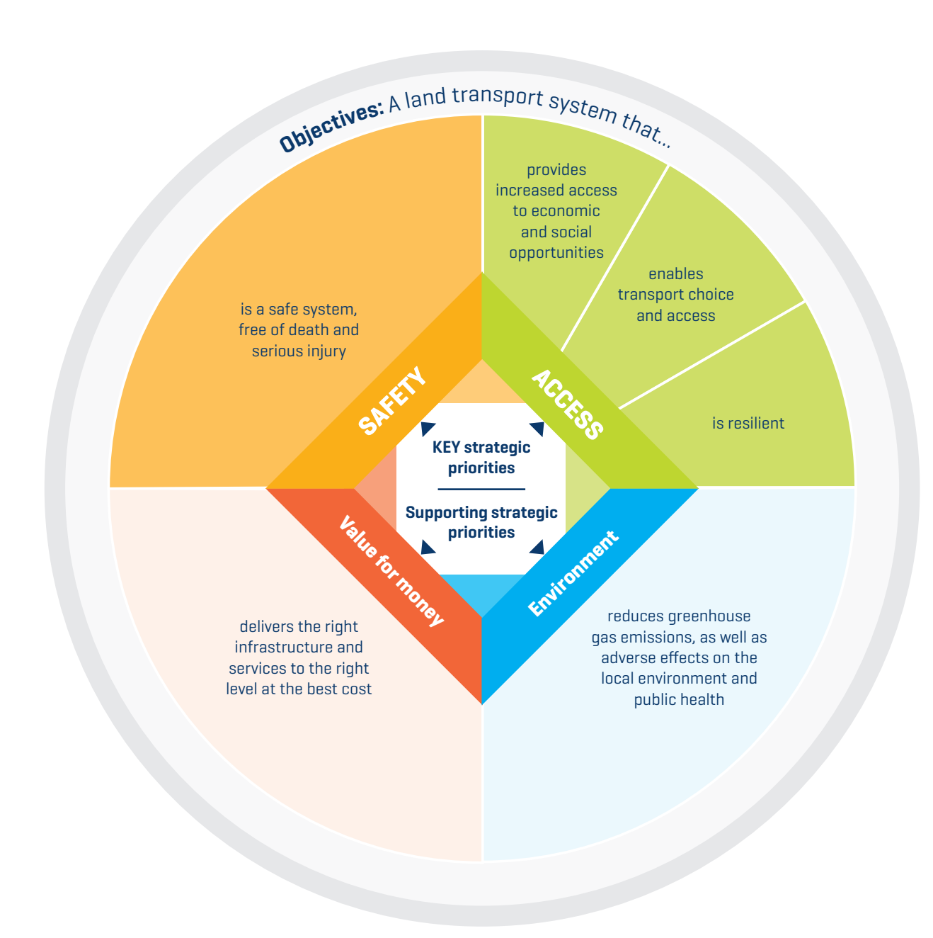
Figure 1: Strategic direction of the GPS 2018