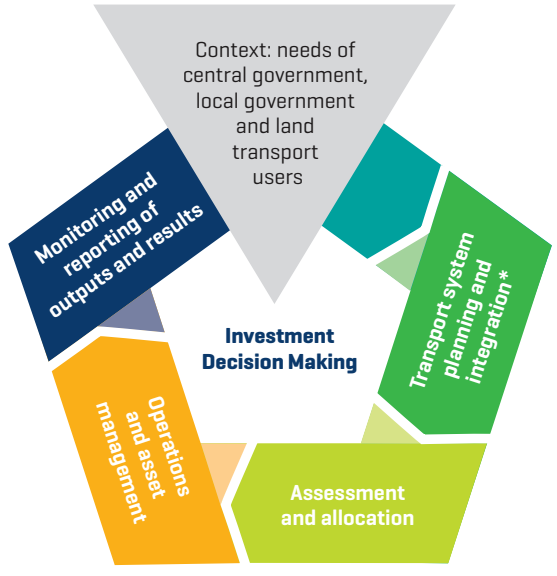
*Includes operational policies and processes